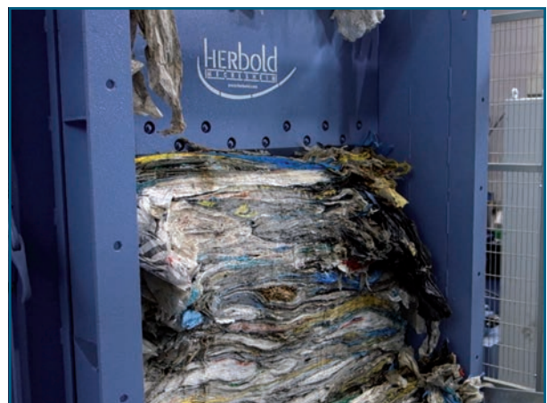
Fig. 2: Cutting the material portions lying under the cutting blade