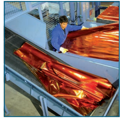
Step 3: Material portions are transferred for further shredding