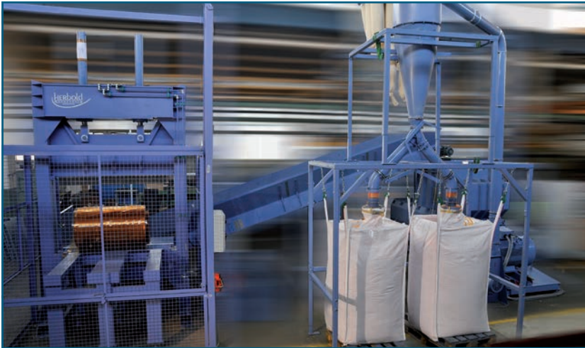
Fig. 3: Combination of guillotine and granulator with supply bunker

Safe handling of rolls that do not roll off, uncomplicated feed of cut sheeting parcels into the supply bunker of the granulator.