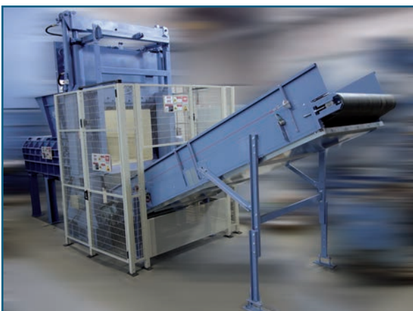
Fig. 1: Guillotine cutter HGS 150 with EWS hydraulic ram