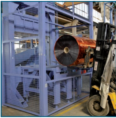
Step 1: Feed in of material is done via fork-lift truck