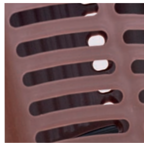
Aeration slots in the body for complete ventilation