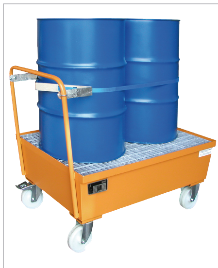
AW-F 2 with fixture and tension belt

Applies to all products shown on this page