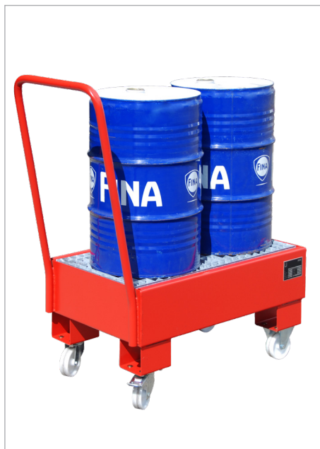
AW 60-1 SR