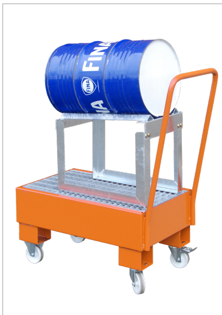
AW 60-1 SRF