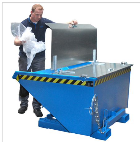
EXPO with lid