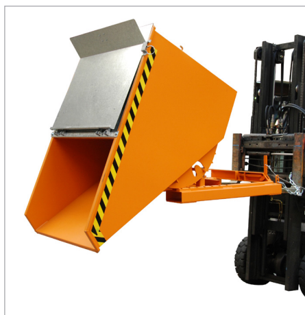
EXPO with lid