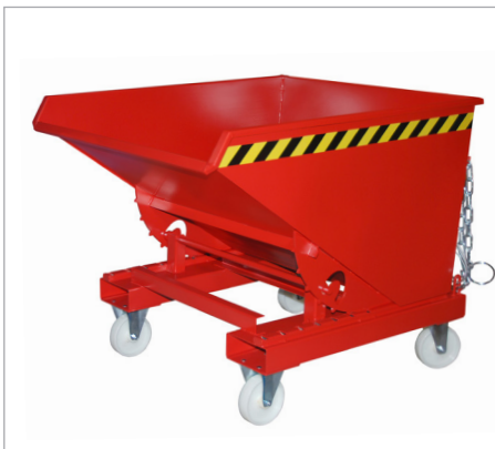
EXPO with castors