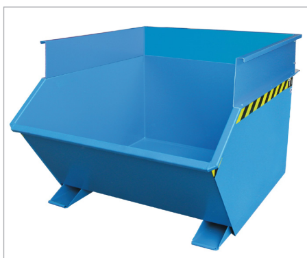
GU with extender frame