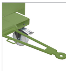
Trailer coupling and towing bar