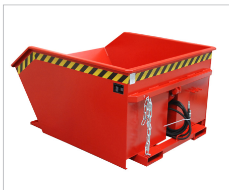
GU with adjustable dumping brake