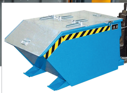
GU with lid