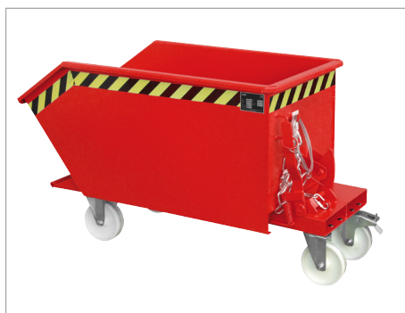
GU with castors

Note: other sizes available (please refer to page 11, Mini Tilting Containers)