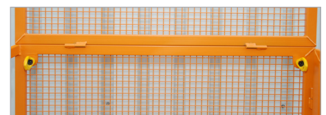
PPE anchor points (personal protective equipment)